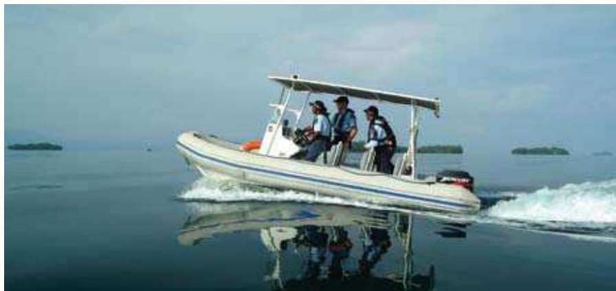
Royal Solomon Island Police and Regional Assistance Mission to the Solomon Islands Federal Agents head out to check a logging camp